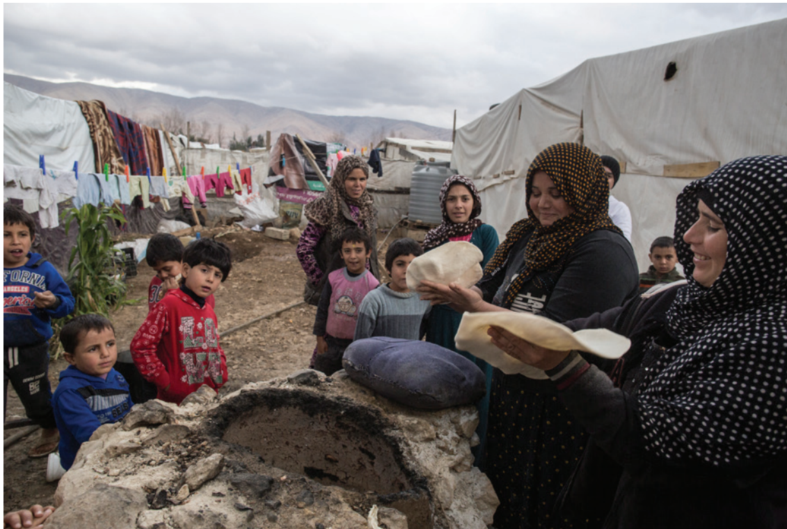
By Sam Tarling

as cash in envelope is because beneficiaries can have documentation or protection issues where they do not feel comfortable, or it is not safe for them to move and cross checkpoints. 40 In addition, the provision of in-person case management services upon which the assessments and decisions to disburse protection cash to beneficiaries depended remained challenging, with certain groups, including Syrian women living in informal tented settlements (ITS) not able to move easily and most at risk of being left behind in programme responses.